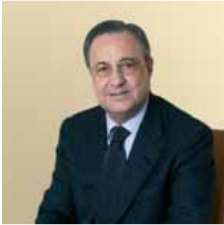
Mr. Florentino Pérez Rodríguez Chairman and CEO