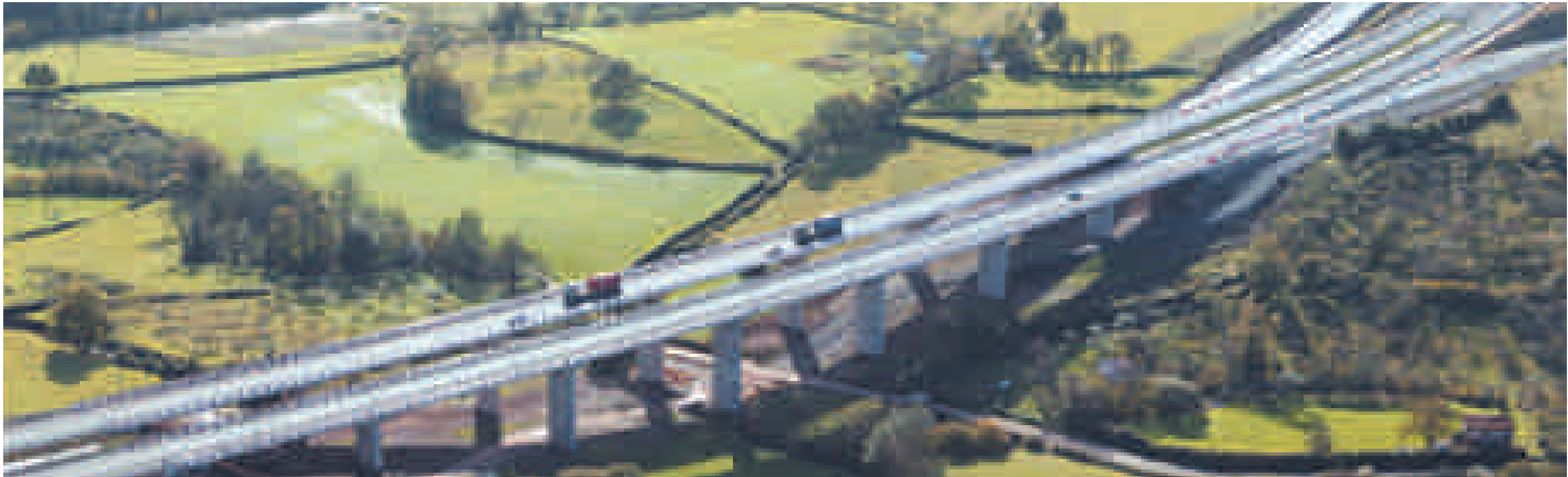
Grases Viaduct (Asturias)