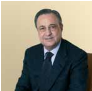
Mr. Florentino Pérez Rodríguez Chairman and CEO